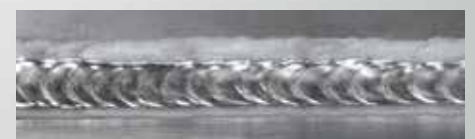
DUO Plus™ - Aluminium

The function improves control of the weld pool and reduces heat input.