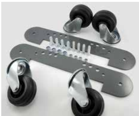
Set of wheels for mounting under protective frame (item number 78861413)