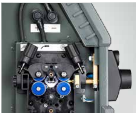
LED light in wire console (item number 78861545)