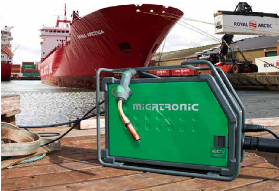
The Omega Yard 300 is ideal for use in shipyards, workshops and on construction sites; here shown with protective frame which is optional equipment.