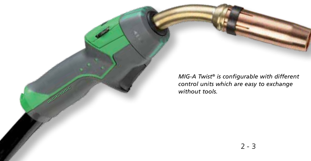
MIG-A Twist® is configurable with different control units which are easy to exchange without tools.

The ergonomic MIG-A Twist® torch has a turnable swan neck for easy access to hard-to-reach locations. Control unit or sequence control unit for adjustment of welding current at the torch handle is available as optional equipment.